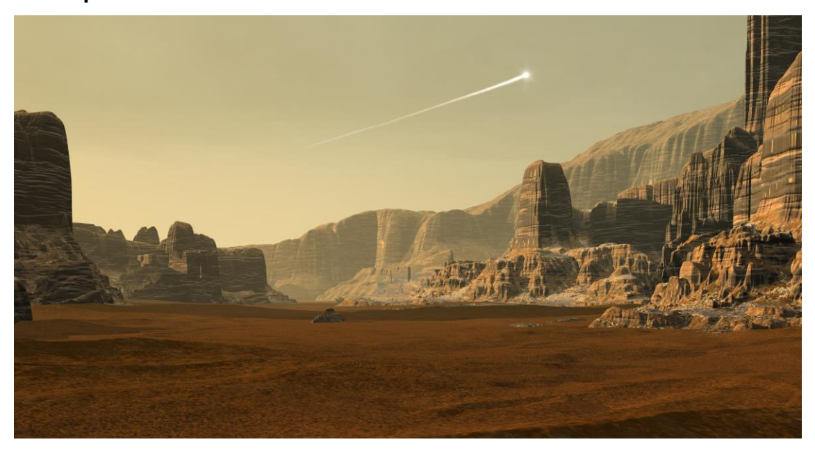
Artist depiction of the floor of Valles Marineris, with a lander craft approaching.

19:55 (Universal Time) Tuesday, December 23, 1975 'C' Command bridge of the spaceship U.S.S. LIBERTY In low polar orbit around Mars