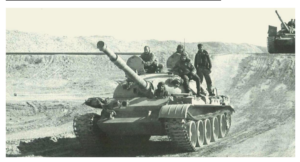
Egyptian tanks on the move

17:43 (California Time) / 20:43 (Washington Time) / 01:43 (Universal Time) Saturday, December 4 / Sunday, December 5 (Universal Date), 1976 'C' Communications center of the Aurora Space Station Low Earth polar orbit