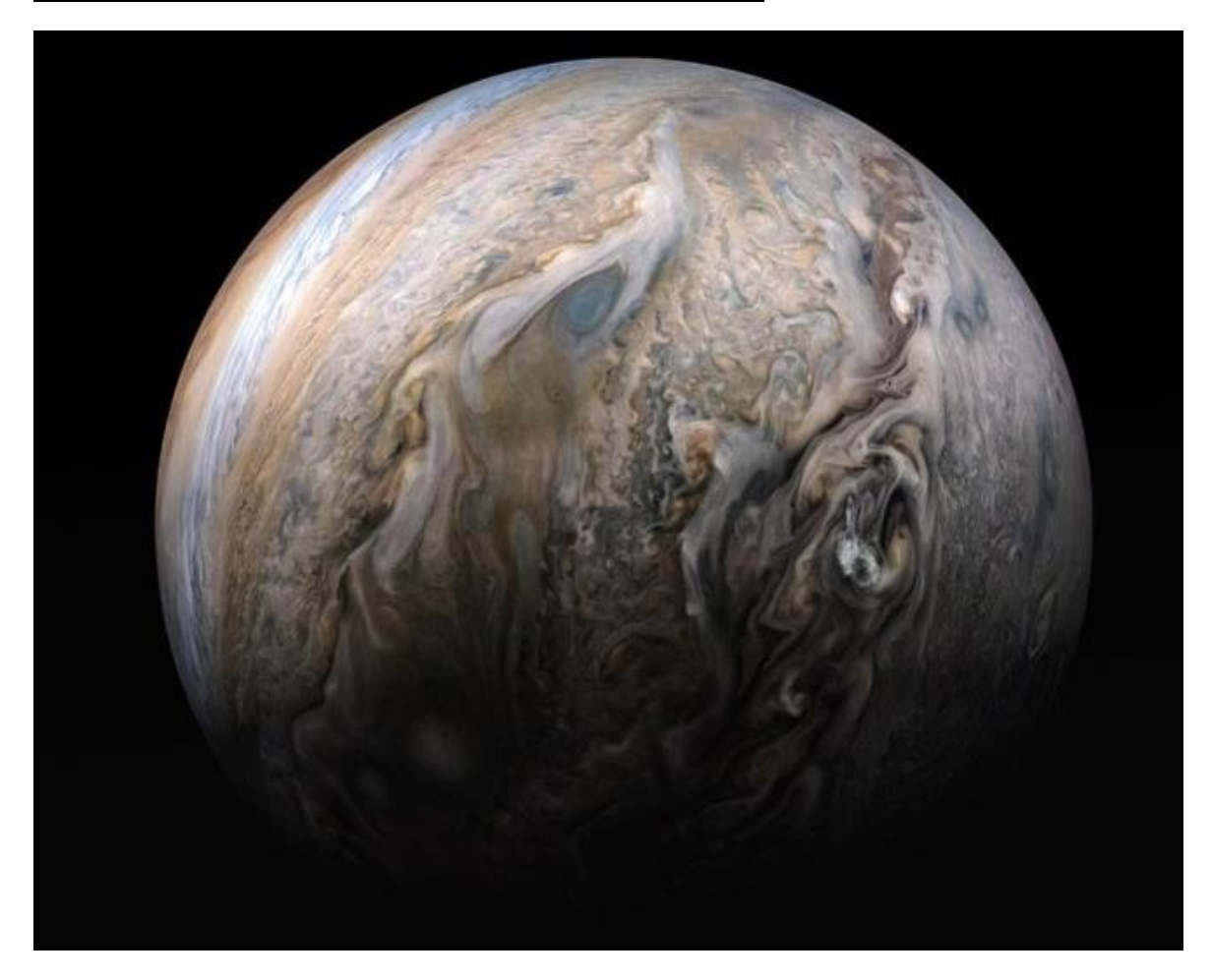
09:59 (Universal Time) Thursday, August 7, 1980 'C' Command bridge of the U.S.S. PROMETHEUS Low Earth orbit near the AURORA space station

"Warning! One minute to engines ignition. All crewmembers and passengers must be in their seats, with safety belts buckled... Thirty seconds to engines ignition. This is the last warning... Ten seconds to engines ignition... Five, four, three, two, one, chemical rocket engines ignition, full power!"