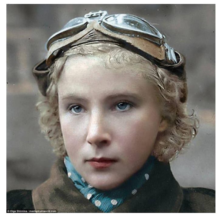
Lydia Litvyak, Hero of the Soviet Union, at age 22 in 1943 'A', during WW2. Killed in air combat over Ukraine in 1943, with 12 certified air victories to her credit.

15:01 (California Time) Wednesday, March 6, 1974 'C' Arrivals terminal, Los Angeles International Airport (LAX) California, U.S.A.